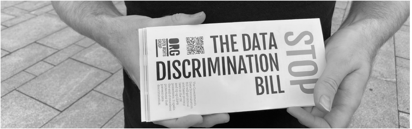
Licensed under a public works license